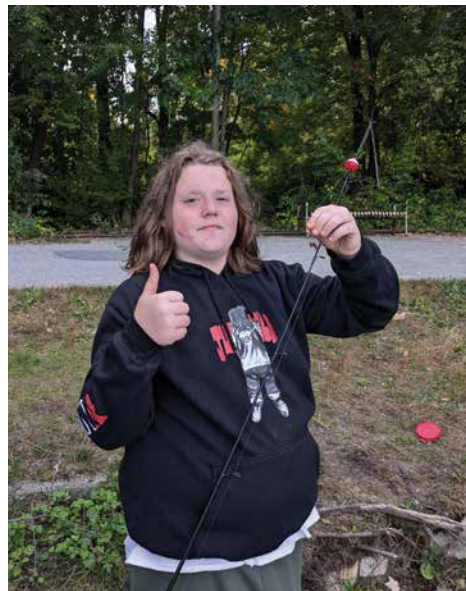
Kyon's always up for a fishing trip!