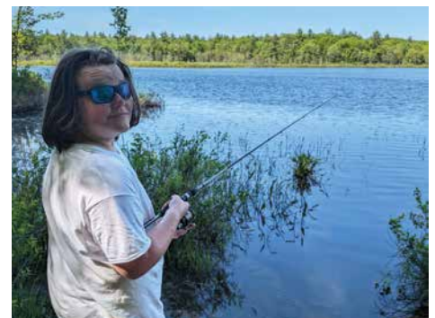
Let's go fishing!