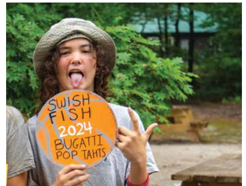
Iroquois – basketball champ!