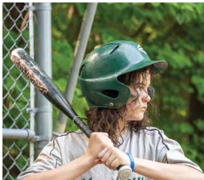
Iroquois – a determined sportsman!