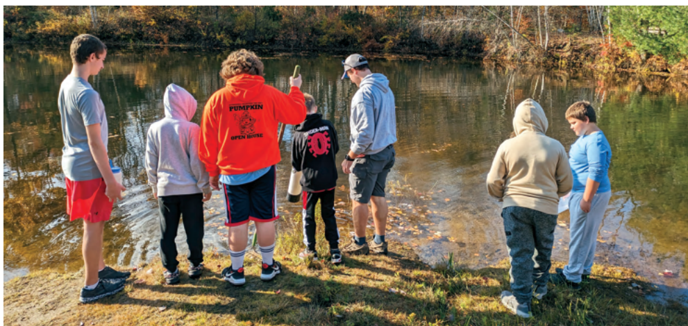
Weed Watchers at Work!

fulfillment in the work. When given the choice of a less arduous task on day two he declined because he genuinely enjoyed the difficult labor of the trail work – it was a new experience for him! He even expressed interest in continuing to volunteer at the farm during the school year.