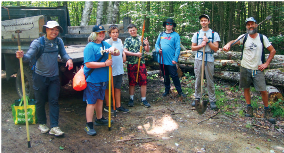
The Links at D Acres Farm

In 2023, Mayhew collaborated with several organizations to not only support community initiatives, but to provide opportunities for the boys of Mayhew to practice community-building, volunteerism, service, and hard work on behalf of others