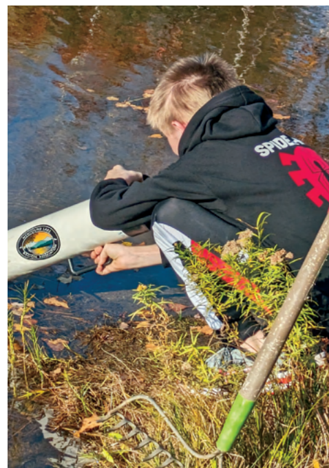
Checking Newfound's Water